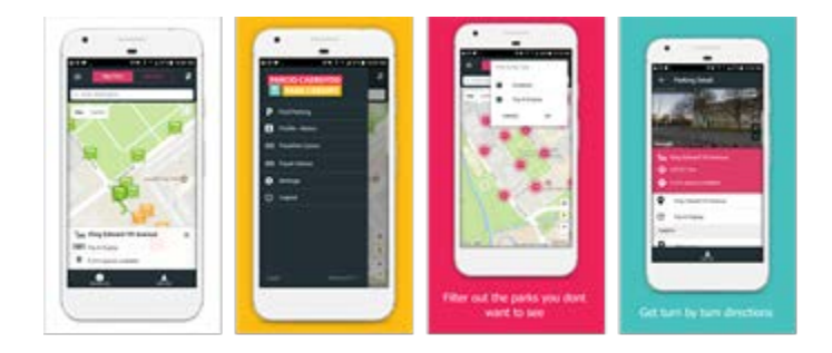
Illustration: Smart Parking Ltd.

mobile application (app) via iPhone or Android devices for customers to view a current picture of